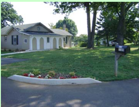
GLIA Present Mosque - Exterior