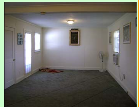
GLIA Present Mosque - Interior

"Whoever builds a Mosque, seeking by it Allah's (SWT) grace, Allah will build for him a similar house in paradise."